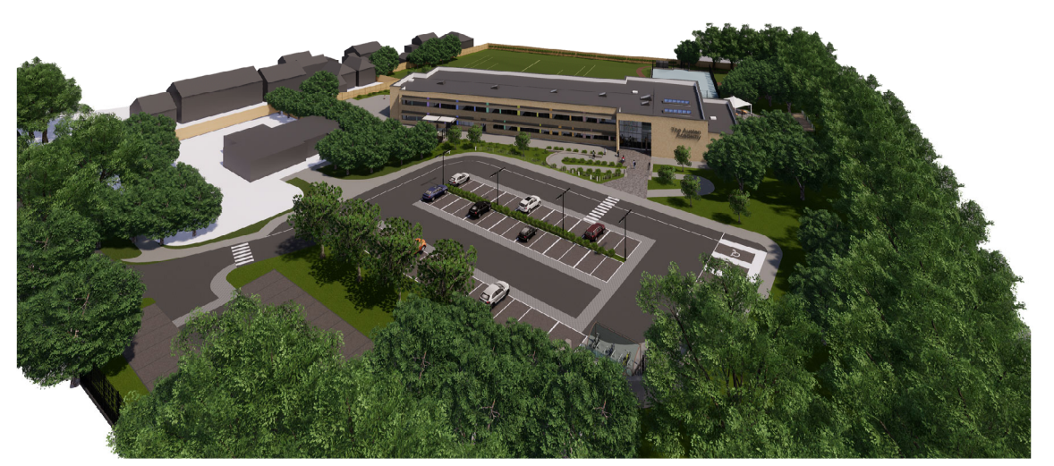
Aerial View Looking Noth