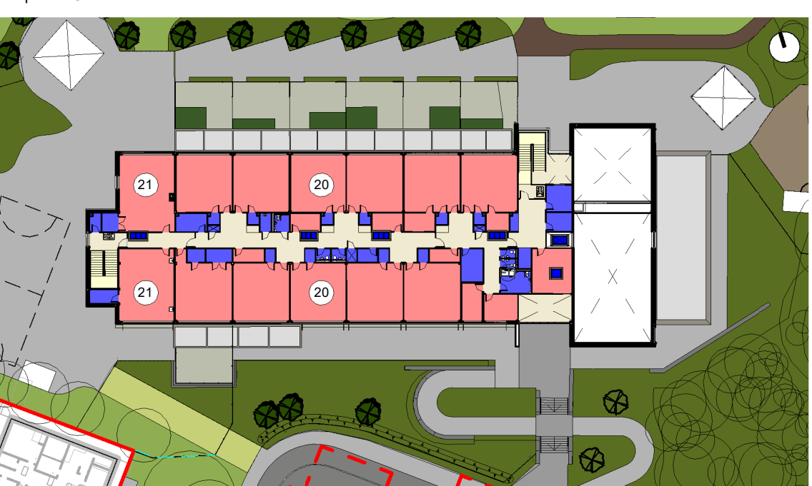
Proposed First Floor Plan